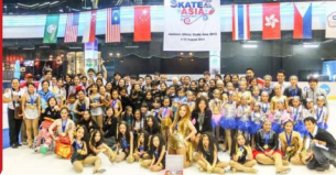
The Rink Ice Arena @ Central Plaza Rama 9 team from Bangkok took the championship trophy in the Jackson Ultima Skate Asia 2013 competition.